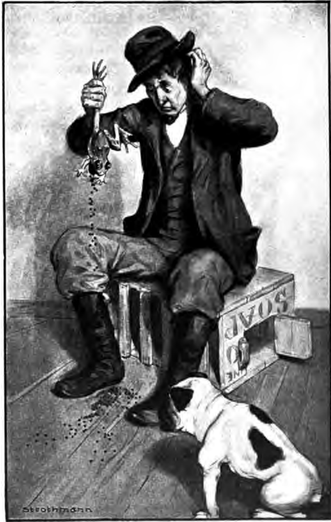
"TURNED HIM UPSIDE DOWN"